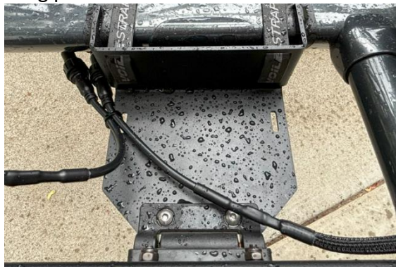
Route cable along rack and test the light.

4. Route the cable along the length of the rack to the vehicle's connection and use cable ties to secure the cable to the rack frame. Bike racks have many pivot points. Be sure to route the cable away from and around pivots to keep them from getting pinched.